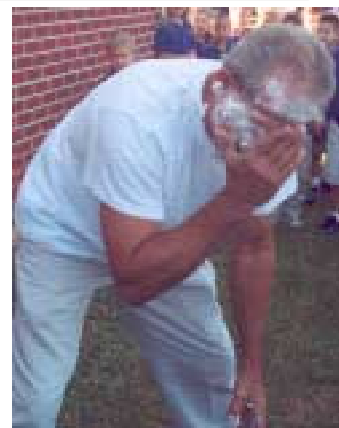
Could he see how hard everyone was laughing?!